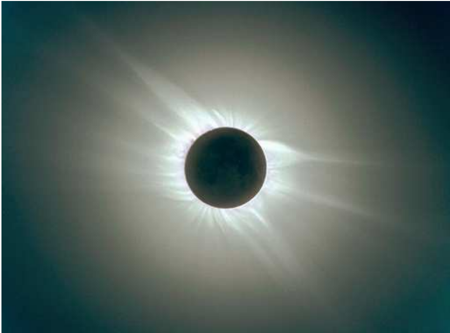
Fig. 2. Processed composite image taken during TSE'06.